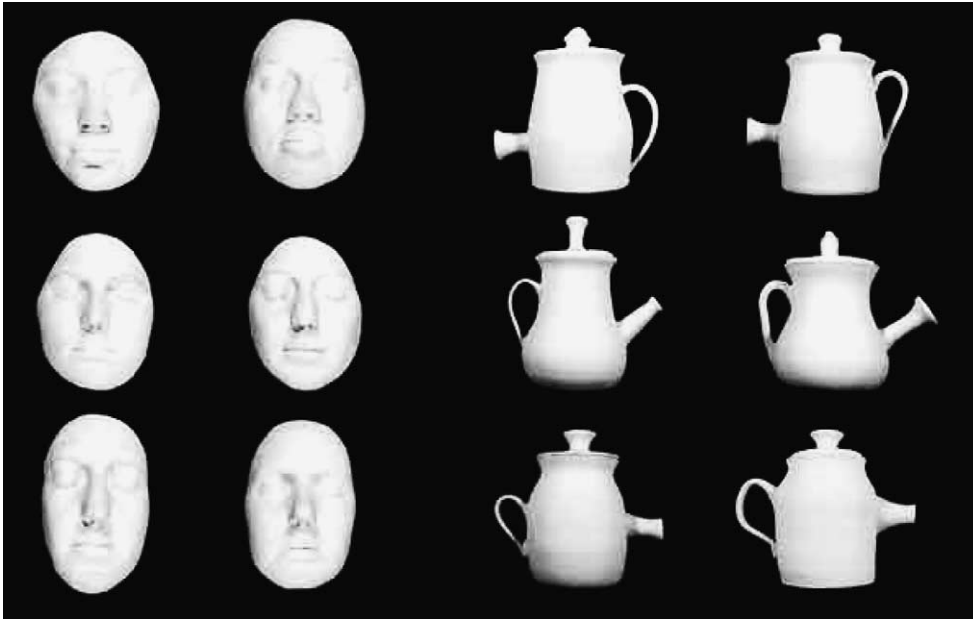
Fig. 1. Examples of the facemask and teapot stimuli used. The three rows on the left of the figure show three different pairs of faces selected to be similar to one another. The three rows on the right are pairs of teapots designed to be similar to one another.

faces were the “same” or “different”. Thirty-six different clay facemasks were paired together based on their being both visually and tactually similar to one another. There were a total of 108 trials consisting of different combinations. One half of the trials were presented in an upright orientation, and the other half were presented in an inverted orientation. Within each orientation, one half of the trials consisted of the same face presented twice; during the remaining trials, two different faces were presented. The experiment was carried out in blocks, which alternated between upright and inverted orientations. The ‘same’ and ‘different’ trials were presented in random order. As the control condition, we tested LH’s ability to discriminate between teapots presented in both upright and inverted orientations. The experimental design was identical to that of the faces, with the exception that LH completed only 36 trials in total, with 18 upright and 18 inverted pairs. Teapots were chosen as control stimuli because they shared some critical characteristics with faces (canonical orientation, common configuration, overall feature similarity, and exemplar-level recognition).