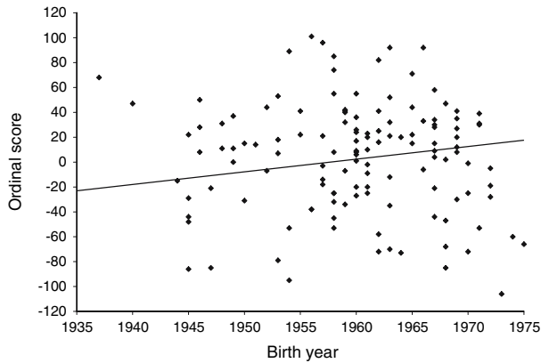
Figure 2 – Birth-year and ordinal ranking 2000–2004

are more likely to get cited. The cardinal ranking that only considers publications is not subject to this age-bias. As shown in Figure 1 there is even a mildly positive relationship between birth year and cardinal score. Figure 2 shows that the ordinal ranking is not subject to an age-bias either. Apparently, due to the 5 year time window young economists can achieve a higher ranking early in their career.