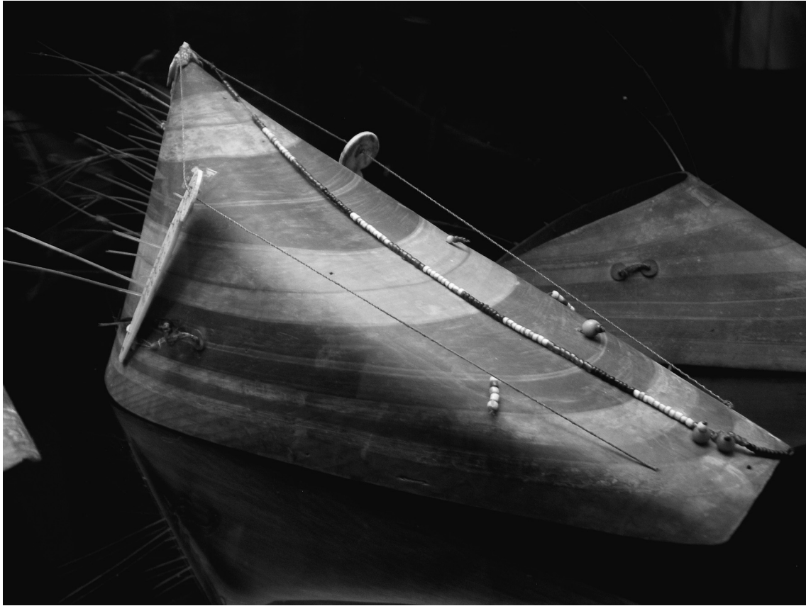
Figure 15.4 Example of a wooden early 19th-century Unangan hunting hat (National museum of Finland). The bone ornaments on both sides are shaped after the head of a bird and represent wings. Wearing a hat like this would enable a hunter to adopt the speed, agility and keen eye of a bird. The decorations furthermore warded off evil spirits and magical powers and enabled the hunter to lure out prey (Black 1991).

also points in this direction. Such trophies flaunt the hunter's status and capabilities and augment his reputation. It may have been the specific qualities of the white-tailed eagle that were much sought after by the Mesolithic and Early Neolithic inhabitants of the Lower Rhine Area. Its keen eye, superior speed, stealth and agility were acquired by proxy and subsequently objectified in the use of specific eagle elements. In this way the hunter may have assumed control over these qualities metonymically, as suggested by the ethnography of the chagudax wooden hats and the eagle fletchings.