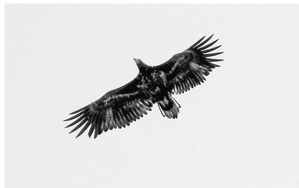
Figure 15.1 Young white-tailed eagle in flight.

The white-tailed eagle is an impressive bird of prey, its fingered wings spanning circa 225 cm. Its massive in-flight profile led the Dutch to lend it the rather befitting popular name of 'flying door' ( vliegende deur ) (fig. 15.1). Young birds are of an overall brown colour, tail included. Adult animals have a dark brown coat of feathers with slightly lighter ochrous colours around the neck and head. The short and wedge-shaped tail of adult animals is white, the large beak bright yellow, and the talons are uncovered. The white-tailed eagle can also be recognized by its loud, high-pitched call, a sound akin to kjicklickleak-tjegjegow , or, when agitated, kra or krau . The bird is indigenous to Europe as well as large parts of Asia, both as a migratory and local