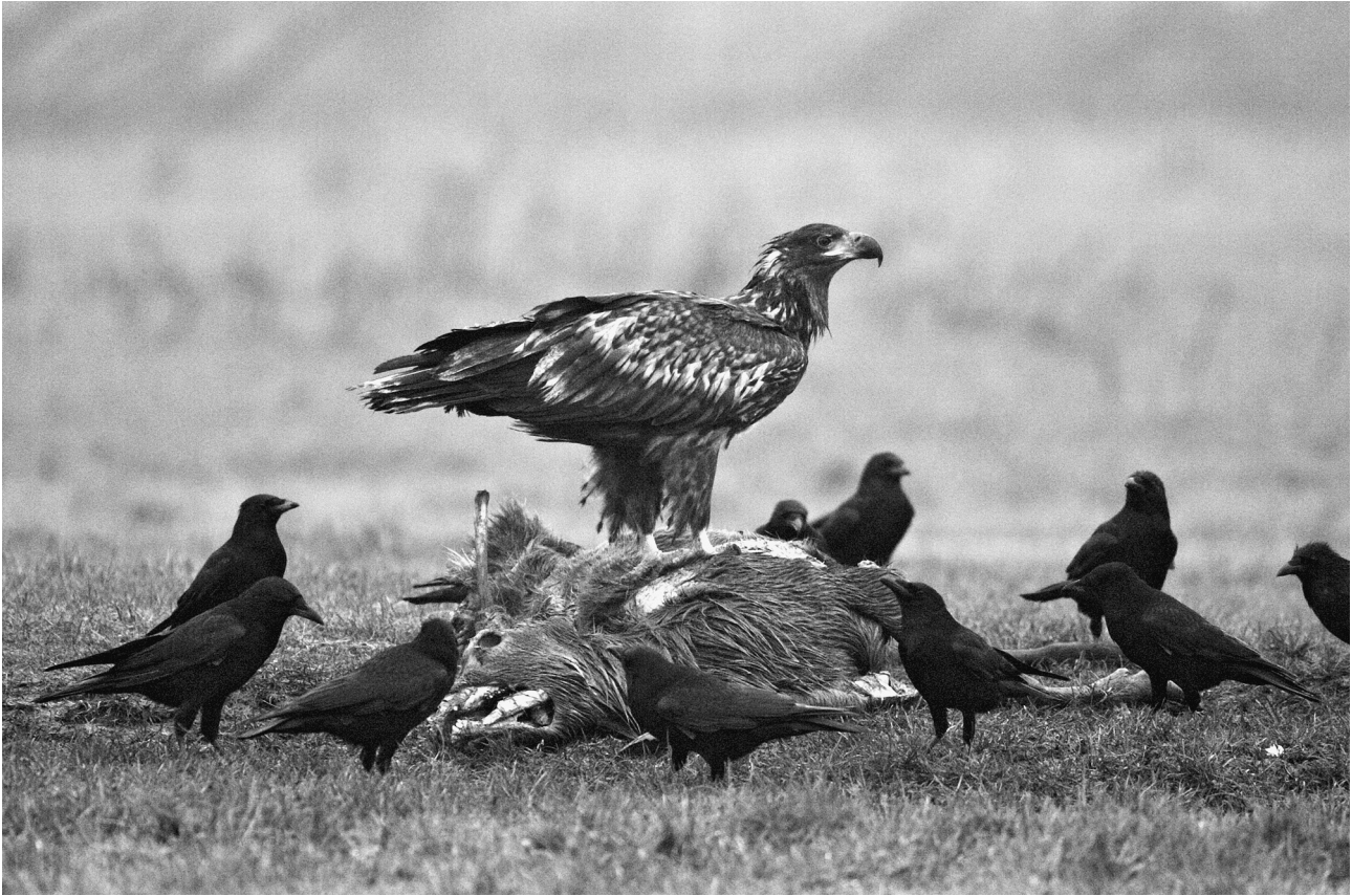
Figure 15.2 White-tailed eagle on top of prey (young red deer).

(Flevoland). A webcam placed next to the nest by Staatsbosbeheer, the Dutch national forestry service, registered how in March 2007 several eggs were laid in the nest and how one female bird survived and left the nest in July. Therefore it should be realized this bird can only be used with caution as a seasonal indicator species.