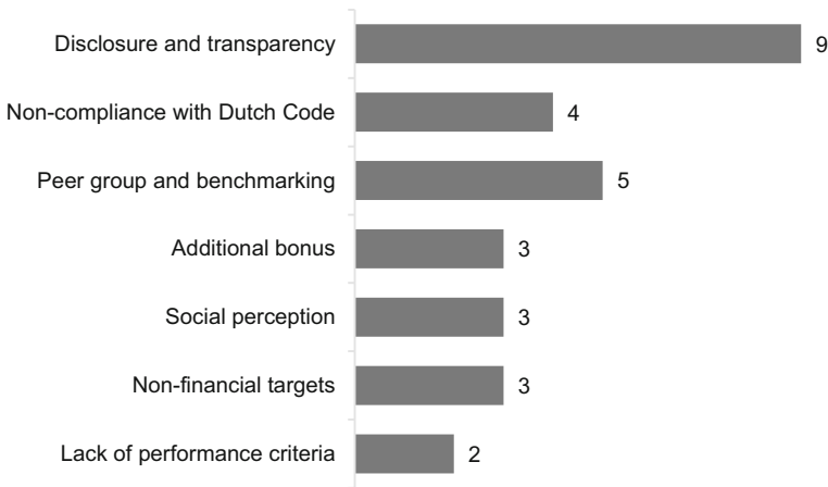
Fig. 2 Reasons for opposition (# general meetings)

b The amount of votes against this rejected resolution was not reported in the minutes of Vastned Retail in 2008. Please refer to Table 3