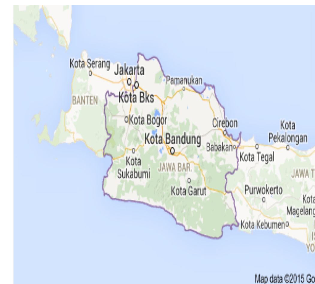
(c) Map of West Java where Sundanese live