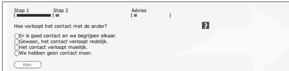
Figure 2: A screenshot from the Rechtwijzer . Here, the user is asked about the interaction with the other party: How is the communication with the other? - There is good interaction and we understand each other - Normal, there is reasonable interaction - interaction is difficult - there is no interaction

The figure below shows some advice from the Rechtwijzer . The column on the left lists the actions that are needed in this case, and the top row lists the conflict resolution professionals that may perform (some of) these actions. Both the actions and the professionals are 'clickable'. When a user clicks on an action, he or she gets a further explanation about the action. Clicking a professional results in an overview of the practical information such as the working methods, price, options for legal aid, costs, and contact information.