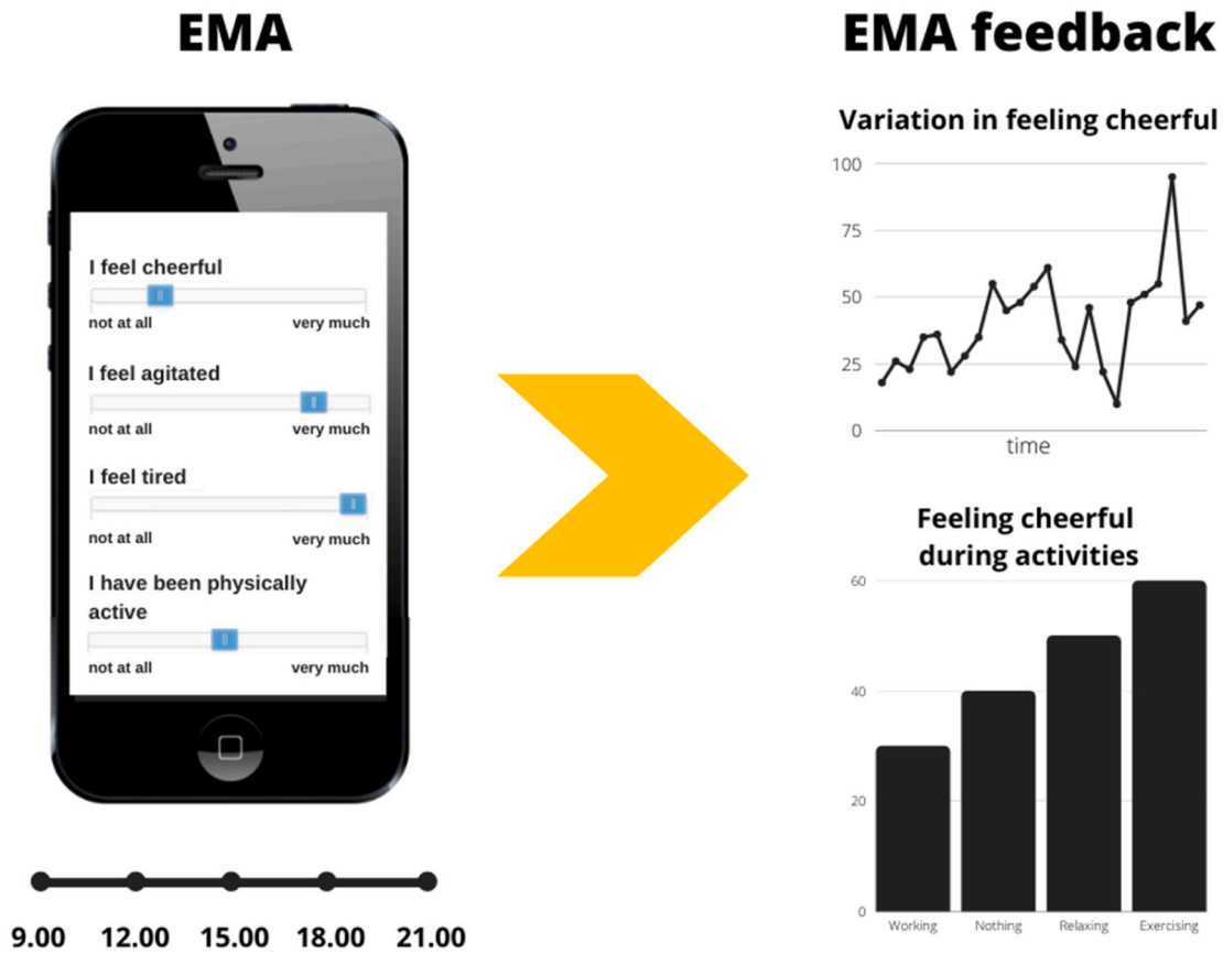
Fig. 1. EMA and feedback. Left: patient answers questions about context, thoughts, and feelings five times a day (e.g., at noon, in the evening). Right: patient and practitioner receive feedback about the answers given by the patient.